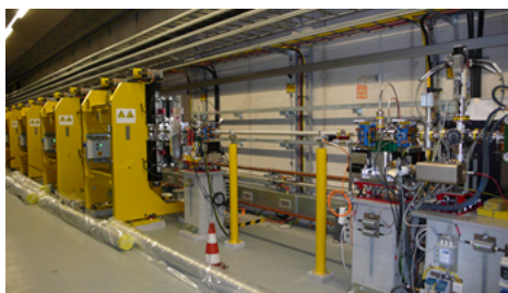
Figure 2: Exit of the SASE undulator section at FLASH2. Two TDS cavities are foreseen to be installed in the free space downstream the undulator.

At FLASH1 [8], the direct measurement of the longitudinal phase space with a deflecting RF structure has been proven to be of uttermost importance to establish femtosecond scale photon pulses [9, 10]. The installation of such a transverse deflecting cavity is planned also at FLASH2 [11]. Its combination with an existing dipole as a spectrometer will allow exploitation of the full longitudinal phase space and to optimize longitudinal bunch parameters for SASE and seeding processes. In contrast to FLASH1, the TDS at FLASH2 will be placed downstream of the undulators (see Fig.2). In such a configuration, the lasing part of the electron bunch can directly be measured and thus provides an estimate of the photon pulse duration as well. The experiment aims for a temporal resolution of less than 10 fs.