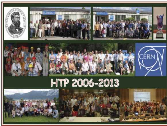
Fig. 1. Participants of the Hungarian Teachers' Program

We organize a follow-up meeting at the end of the year, where the participants report on the results of the teachers experiments and we analyse the evaluation sheets of the individual lectures, visits and teachers' experiments made at CERN and during the travel. That post-meeting is attended by all the teachers and most of the lecturers, by the representatives of CERN and of the sponsors, the Director General of Wigner RCP, the Secretary of the Hungarian CERN Committee and the Chairperson and Secretary General of the Hungarian Physical Society. This programme is quite popular and heavily oversubscribed, and the involved teachers organize student visits to CERN regularly.