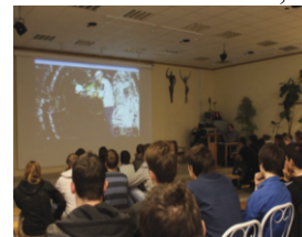
Fig. 3. Secondary school pupils in a CERN Virtual Visit

In these visits, developed on the request of Hungarian physics teachers, the schools' workstations have a 3-way audio-visual connection to the control room of an experiment and to a mobile unit. First the convenor in the control room introduces the experiment, then the mobile unit shows various places of the experiment, some of which are even off-limits for visitors. These visits make it possible to visit experimental areas at CERN for whole classes in their class room, without having to travel to