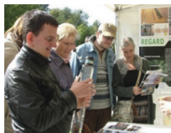
Fig.5.Visitors at Open Day

Atomki and Wigner RCP organizes Open Days, the last ones were devoted to particle physics. Wigner RCP's last one coincided with CERN's Open Day and this year it will be devoted to CERN's 60 th anniversary.