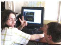
Fig. 2. Students participate in the Masterclass

From the very beginning in 2005 Hungary participates in the annual events of the International Masterclass program. They are organized at 3 institutions in Hungary: