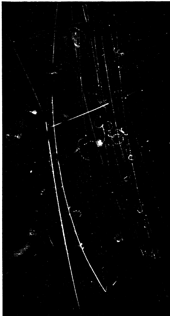
Figure 2. A picture of a \pi^+ -p scattering event. Incident energy = 23 mev, pion scattering angle (lab) = 152^\circ , proton recoil angle (lab) = 12^\circ , pion scattering angle (c.m.s.) = 157^\circ . The picture also shows two \pi - \mu decay events.