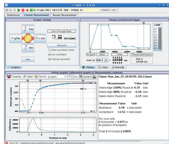
Figure 2: Horizontal beam profile after cooling at 100MeV/c as measured with scraper and scintillating detector.

Deceleration efficiencies of around 85% (3.57 GeV/c to 100 MeV/c) were maintained throughout the year with beam intensities of 3.5 to 4.0*10 7 ejected in one single bunch at 100 MeV/c per 100s machine cycle. Machine performance in terms of quality and stability of the ejected beam was in 2012 more constant than during previous years. Length of the ejected single bunch stayed quite constant over the year at around 150 ns. At 100 MeV/c after final cooling, transverse emittances of less than 1 pi.mm.mrad were obtained for 80 and 95% of the beam in the horizontal and vertical planes respectively. During the start-up, a significant amount of time was spent setting-up the machine for efficient beam-cooling at low energies. As a result, emittances of the extracted beam remained small throughout the run and previously observed degradations needing re-tuning could be avoided. Problems with long tails and halo-like structures in the horizontal beam profile were also reduced. Measured horizontal beam profile after cooling at 100 MeV/c can be seen in Fig. 2.