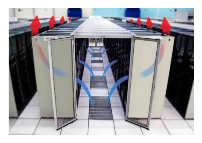
Figure 1: Cold corridor in the CERN main data centre

These modifications have several consequences which, together, resulted in a major increase of the energy efficiency. First of all, the moderate increase of the inlet server temperature combined with the strict separation of cold and hot airflows has allowed increasing the