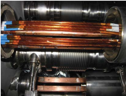
Figure 3: environment of main IC splice, showing spool splices over the main quadrupole splices

cartridge-oven heating, induction and fast resistive heating, where the effect of rapid heating on solder quality is being studied. An important point is the limited available space, and specifically that the main IC quadrupole splices are located close to the existing spool busbar splices which should not be disconnected or damaged, see Fig. 3.