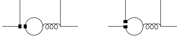
Figure 2: Penguin contractions. Due to colour only the second diagram contributes to insertions of Q_{11}^p, Q_{13}^q .