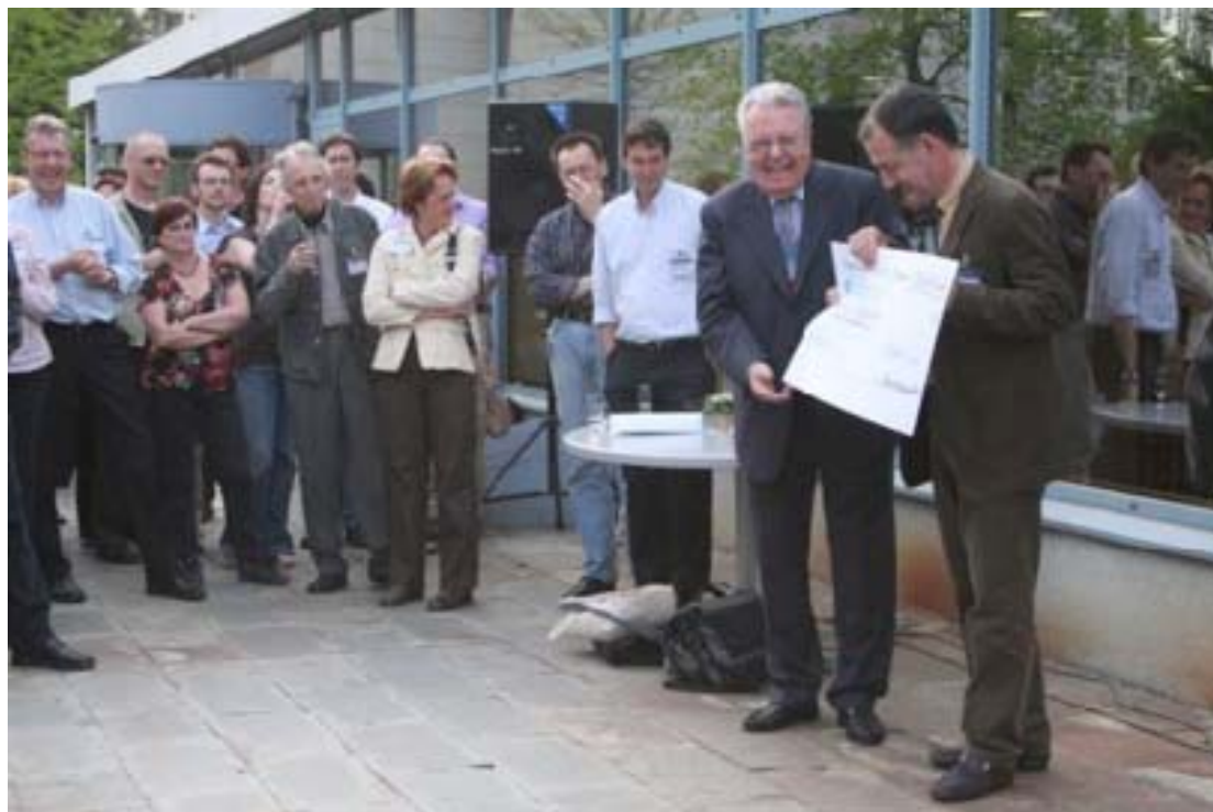
Photo of the Group of CERN officials