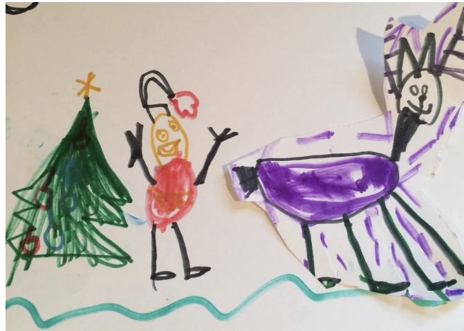
Figure 10: Sample artwork from a researcher's child containing a drawing of a Christmas tree, a person, and an animal.