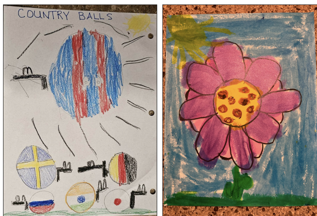
Figure 5: Drawings by P6's son (left) and P7's daughter (right). The children's descriptions emphasized both context (inspired by a YouTube channel; made for a school art event) and content (flag-themed balls; flower with seeds and big purple petals).

Sharing context. For children, conveying the context of the art was just as important as the art itself. For example, P6's son began his description of a drawing (Figure 5), "I used to watch this YouTube channel. It had country balls in it, and they were fighting, and I got really interested in it. So I drew the poster. It's still in progress." Such details enabled P6, the father, to ask follow-up questions, such as which parts were still in progress. Similarly, P14's granddaughter excitedly explained to her grandmother that her artwork involved a dog from her favorite show, "Paw Patrol."