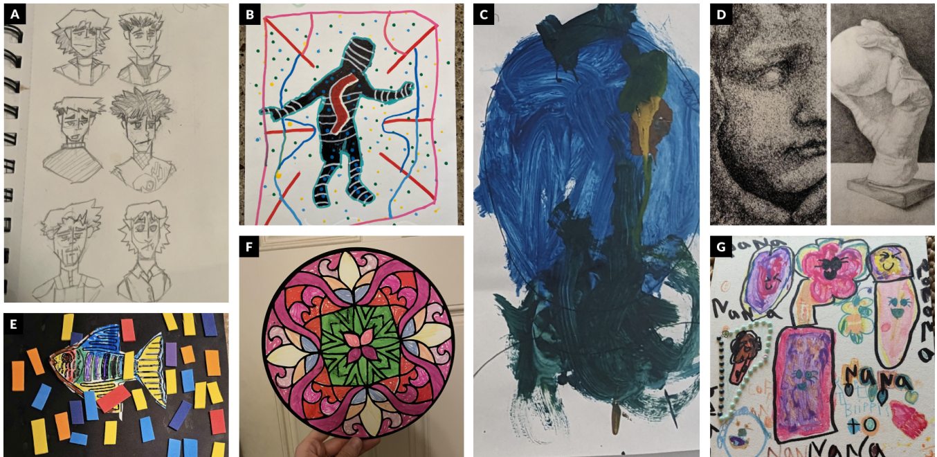
Figure 1: Children in BLV families created a variety of artwork, including: (A) age 14, at-home character sketches, (B) age 9, school project, (C) age 4, school project, (D) age 17, artwork for her portfolio, (E) age 7, school project, (F) age 6, school project, (G) ages 5 and 7, joint drawing done at home. We have removed identifying information from all artwork in this paper.