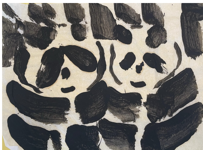
Figure 9: Sample artwork from a researcher's child—a finger painting of two panda bears in black paint on white paper.

See the following examples of artwork provided by researchers run through different AI tools to determine ChatGPT and Be My AI as our final two tools used during our studies. While the results from the Christmas artwork are more mixed, there were some clear dissuading factors for the parent researcher, such as BARD getting the placement of the tree in relation to the animal wrong. These results combined with evaluations of other drawings such as the panda (in which only ChatGPT and Be My AI could recognize pandas on the page) led to us deciding on ChatGPT and Be My AI. Seeing AI was also explored, but as the descriptions were too simplistic, we did not include them in the tables; instead, we report them here. For the panda painting, Seeing AI said: "A black and white painting". For the Christmas artwork, Seeing AI said: "A child's drawing of a Christmas tree and a bird".