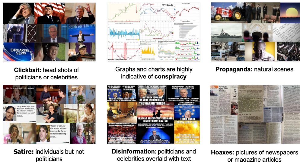
Figure 1: Key findings from the analysis of multimodal deception detection model behavior from (Volkova et al. 2019).

tribute to the understanding of the differences between reliable news sources and those that spread disinformation which can also be leveraged for effective detection models.