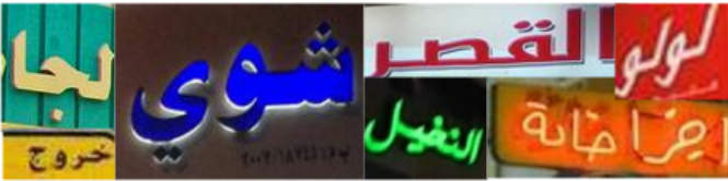
Fig. 4: Sample images from the Arabic scenetext dataset.

markets & shops, billboards, navigation signs, graffiti, etc, and spans a large variety of naturally occurring image-noises and distortions (Fig. 4). The images were manually annotated by human experts of the script and the transcriptions as well as the image data is being made publicly available for future research groups to compare and improve performance upon.