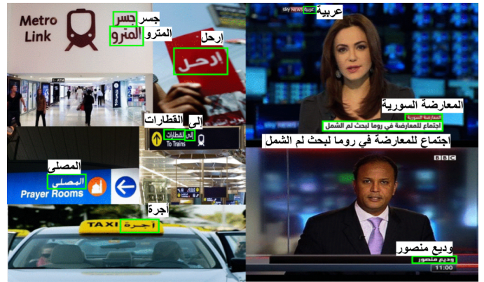
Fig. 1: Examples of Arabic Scene Text (left) and Video Text (right) recognized by our model. Our work deals only with the recognition of cropped words/lines. The bounding boxes were provided manually.

The computer vision community experienced a strong revival of neural networks based solutions in the form of Deep Learning in recent years. This process was stimulated