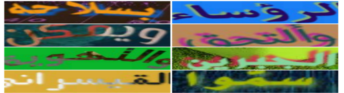
Fig. 3: Sample images from the rendered synthetic Arabic scene text dataset. The images closely resemble real world scene images.

The efficacy of a seq2seq approach lies in the fact that the input sequence can be transcribed directly to the output sequence without the need for a target defined at each time-step. This was proven quite effective in recognizing complex scripts where sub-word segmentation is often difficult [22]. In addition, contextual modelling of the sequence in both the directions, forward and backward, is achieved by the bidirectional LSTM block. Contextual information is critical in making accurate predictions for a Script like Arabic where there are many similar looking characters/glyphs. The hybrid architecture replaces the need for any handcrafted features to be extracted from the image. Instead, more robust convolutional features are fed to the RNN layers.