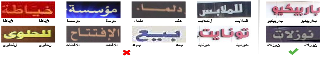
Fig. 5: Qualitative results of Scene Text Recognition. For each image, the annotations on bottom-left and bottom-right are the label and model prediction, respectively.