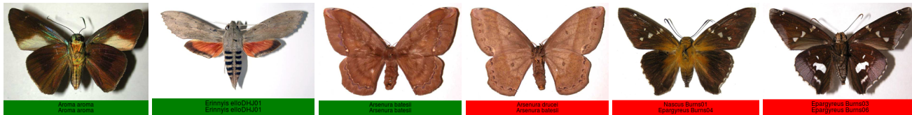
Figure 1: Example classification results for the Costa Rica dataset (input image, predicted label, ground-truth label). Images are directly obtained from [5] and have the following identifiers: 00-SRNP-1311-DHJ33001, 00-SRNP-1536-DHJ95316, 00-SRNP-4253-DHJ36384, 00-SRNP-4253-DHJ36385, 01-SRNP-16434-DHJ305668, 03-SRNP-20073-DHJ91439.

images have been taken in a controlled environment with uniform background and canonical poses, which makes it easy to focus feature extraction on the important parts of the image. Since the dataset only includes a few images per species, we use male and female individuals within one category. We will release a challenging subset of the dataset to the public.