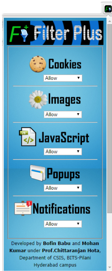
Figure 3: User interface of FilterPlus

allows cookies to be set only for the current session and they will be removed when a new session starts. Disabling cookies will prevent sites from storing confidential user information in the host computer.